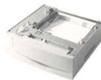
LaserWriter 12/640 PS 500-Sheet Cassette and Feeder Part #: M4682G/A

Unit easily attaches to printer for professional-looking double-sided pages. SP: $399