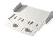
LaserWriter 12/640 PS Face-up Output Tray Part #: M4698G/A

Cassette handles a wide variety of envelopes—up to 50 at a time—and even handles postcards. It requires the 500-Sheet Cassette and Feeder. SP: $149