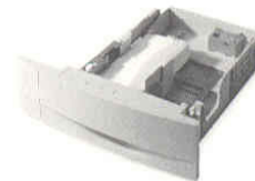
LaserWriter 12/640 PS Envelope Cassette Part #: M4680G/A

For bulk printing—or for workgroups—this option sits directly beneath the printer and won't encroach on office space. SP: $399